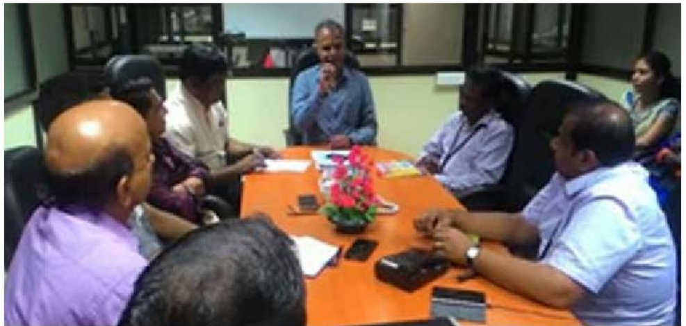
Hindi Workshop STPI, Thiruvananthapuram