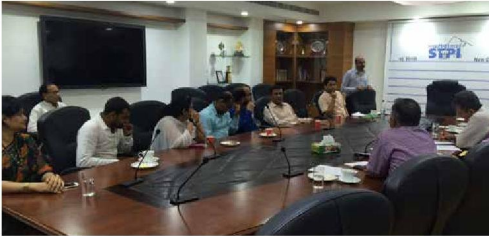
Hindi Workshop STPI HQ, New Delhi