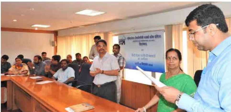
Hindi Workshop STPI, Hyderabad